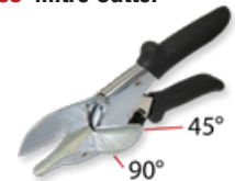
AP4255 Mitre Cutter