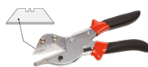
BST060 Heavy Duty Blade Cutter