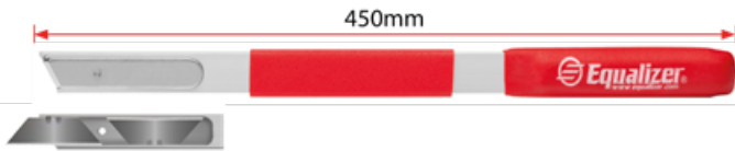
QS358 Equalizer Trimming Long Knife - 450mm

Uses #OZ-BLADES or extended length #ULB582 replacement blades.